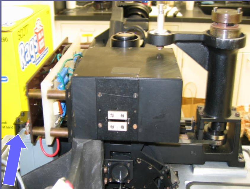
Back of Wedge