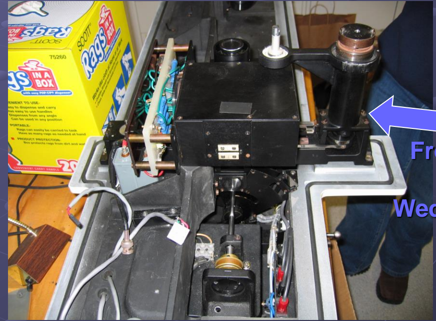
Front of Wedge

Orient yourself with the front and the back of the Wedge